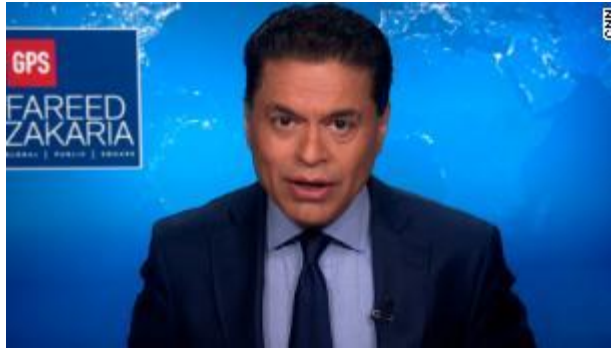
Fig. 1. Global Public Square airs on CNN on Sundays at 10 AM and 1 PM U.S. East Coast time.