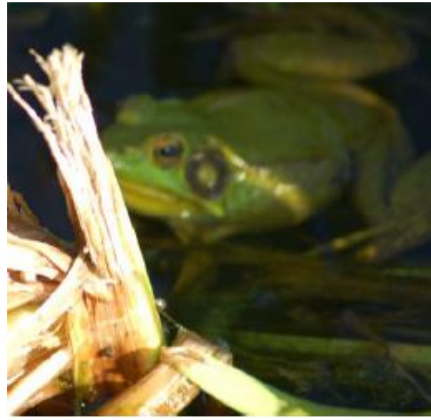
Fig. 38.2. Jeremiah.